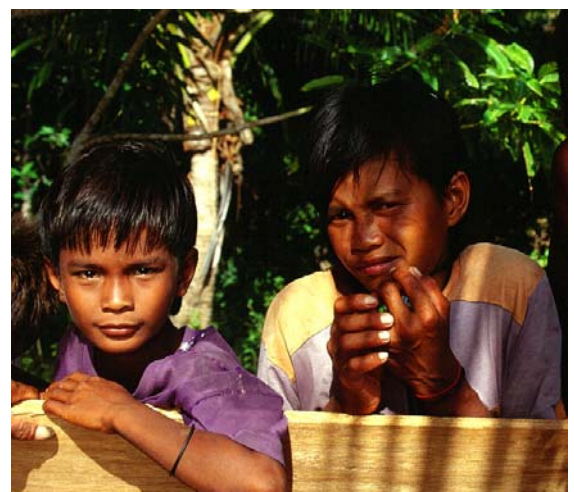
Figure 98. The environmental education programme should benefit children living on the islands.