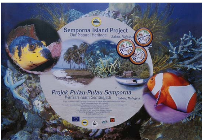
Figure 97. Poster and badges produced for the Semporna Islands Project.