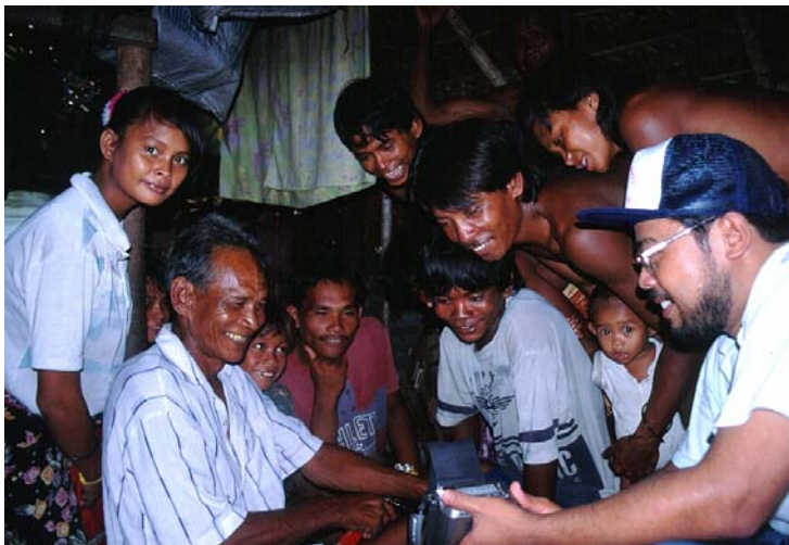
Figure 94. Community involvement during the making of one of the SIP videos.