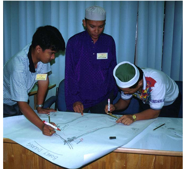
Figure 95. A planning exercise during one of the SIP workshops.

The aim of the programme was to provide information about the project and its aims, raise the profile of the Semporna Islands and reefs, explain the need for conservation action and present management options for discussion.