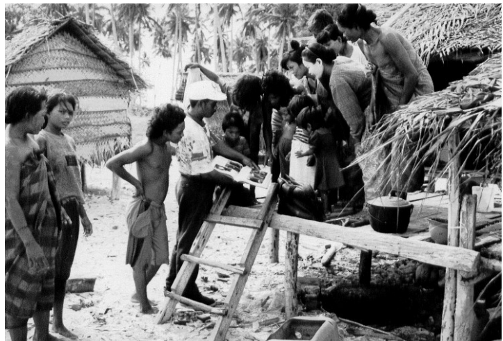
Figure 100. Park staff discussing identification of marine life with people on Pulau Sibuan, during marine resources survey, 1999.