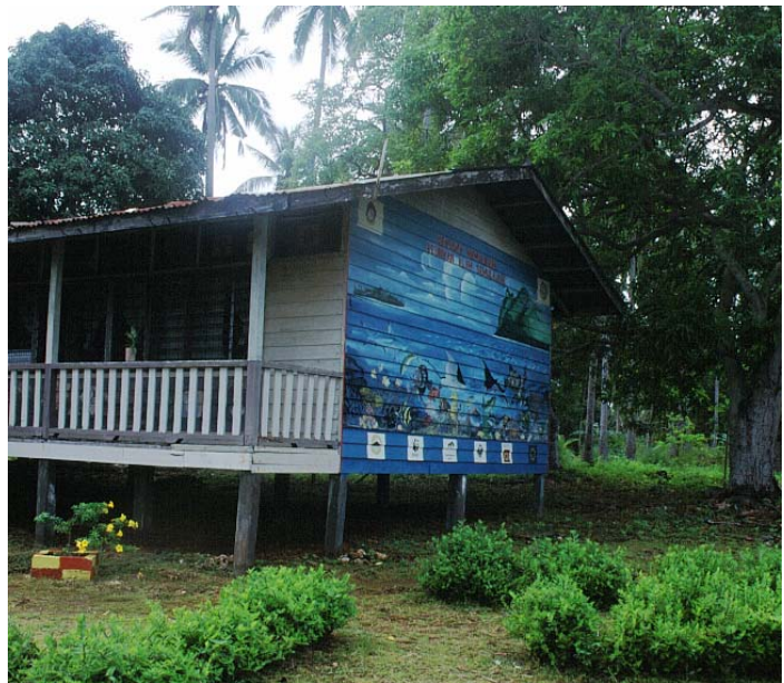
Figure 93. The Science Block at the school on Selakan where the teachers and pupils decided to make a mural in support of the Semporna Islands Project.