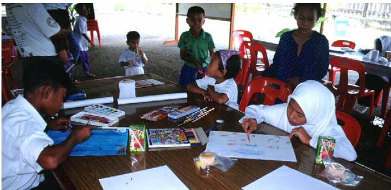
Figure 96. Semporna schoolchildren taking part in the painting competition